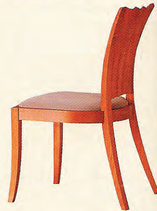
ARIA 36" high x 19" wide x 24" deep. $1,650. Thos. Moser; 800-862-1973, thosmoser.com.