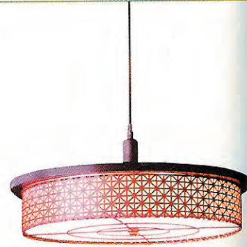
CUBANO 6" high x 20" diameter. $1,700. Ⓡ Donovan Design; 631-283-8175, donovandesign.com.