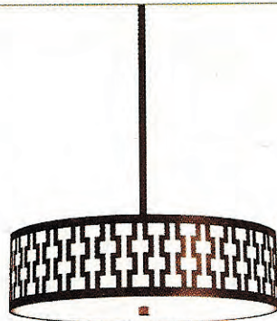
KYOTO 7½" high x 26¾" diameter. $4,675. Ⓡ Boyd Lighting Company; 866-251-7777, boydlighting.com.