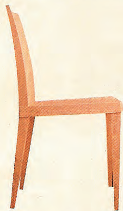
ARJA 34" high x 17" wide x 16" deep. $480. Mobili De Angelis; 973-744-2447, mobilideangelis.com.