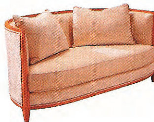
LOVE SEAT #F473 34" high x 70" wide x 41" deep. $7,740. Swaim Furniture; 336-885-6131, swaim-inc.com.