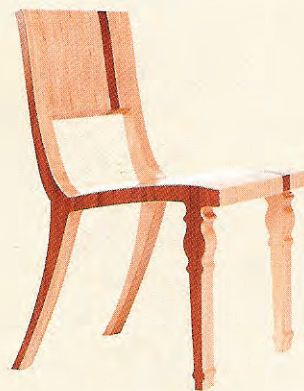
SIDE CHAIR 32" high x 18" wide x 21½" deep. $1,078. Context Furniture; 248-200-0724, contextfurniture.com.