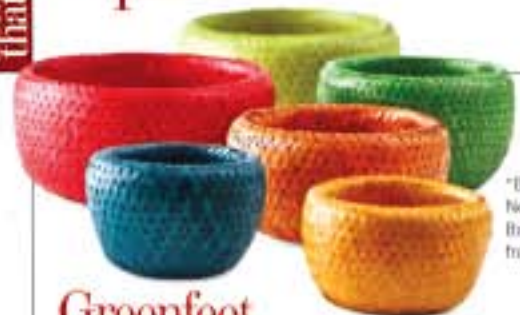
"Bambu Nesting Baskets," from $15.85.